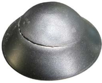
ERICHSEN Cupping Test