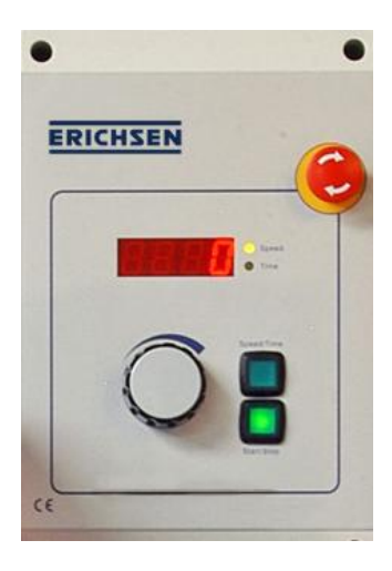
Fig. Front view model 492 I

The DISCOVERY serie 492 IV, 492 V and 492 VI have improved controls to monitor all the processes in one screen (compact 5 inch TFT colour touch panel with data storage function).