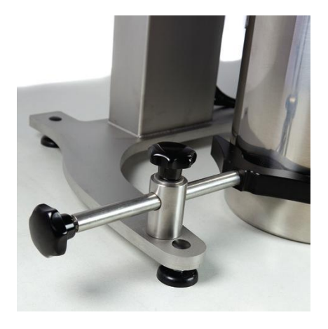
Fig. Stainless steel foot with quick-fit clamping device

The stand's bottom end is attached with a quick fixing device, equipped with a safety switch which interrupts the current supply to the motor as soon as the fixing pressure to the stirring vessel is no longer sufficient.