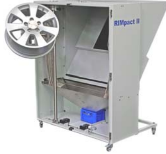
RIMpact II-VDA Impact cabinet (for Mod. 508 VDA)