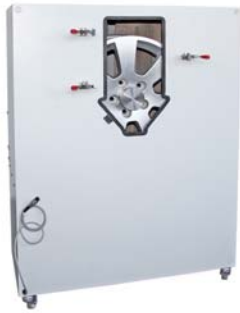
RIMpact I – Impact cabinet (for Mod. 508 SAE or VDA)