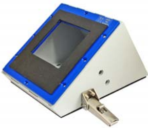
Attachment for tests in accordance with PSA D24 1312 (for Mod. 508 VDA)