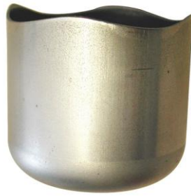
Deep Drawing Cup Test