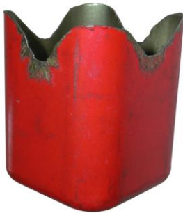
Square Deep Drawing Cup Test