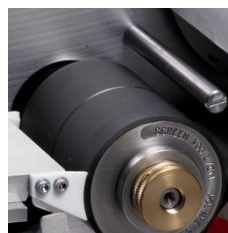
Ceramic anilox – multiple bands