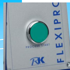
Dual start buttons for safety