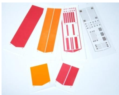
Print samples of the FlexiProof 100