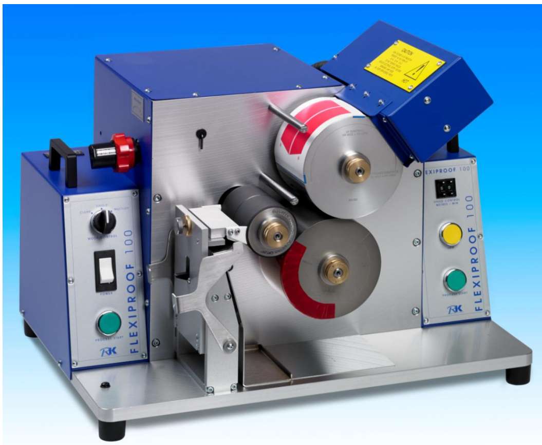
The FlexiProof 100 UV

The RK FlexiProof 100 offers a high speed, operator-friendly machine for the production of proofs using water, solvent or UV Flexographic inks. It is an essential tool for all those involved in the manufacture and use of flexo inks. Ideal for quality control testing to ensure consistency of performance of inks and substrates over time, presentation samples, printability of substrates, R&D including product and commercial viability, and computer colour matching data.