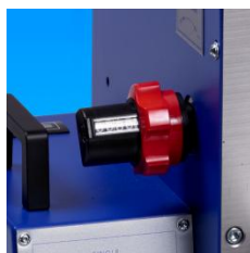
Digital pressure setting, 4 m steps