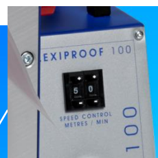
Digital speed control 20 – 99m/min