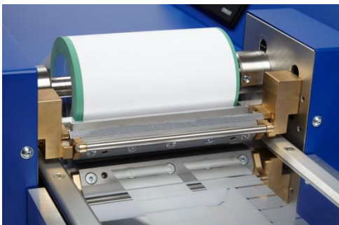
Below: Detail of the GP100 in use

High quality proofs using gravure inks of press viscosity are produced instantly using the new GP100. Featuring a microprocessor controlled servo drive and pneumatic operation, electronically engraved printing plates and variable printing speeds of 1 to 100m/min, this is an essential tool for all those involved in the manufacturing or use of liquid inks. Ideal for R&D and computer colour matching data, quality control and presentation samples, the GP100 is very easy to clean.