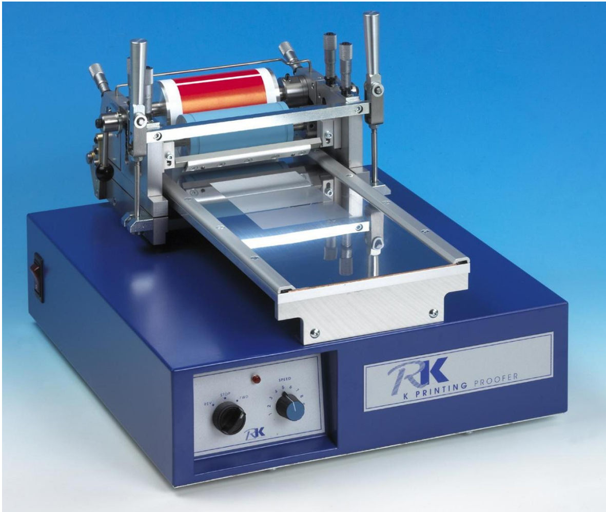
Above: K Printing Proofer Flexo Head