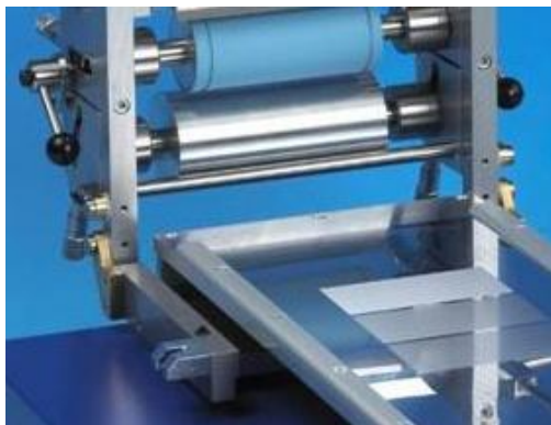
Below: Detail of the K Printing Proofer Flexo Head

High quality proofs using gravure, gravure-offset or flexo inks are produced instantly using the K Printing Proofer. Featuring electronically engraved printing plates and variable printing speeds of up to 40m/min, this is an essential tool for all those involved in the manufacturing or use of liquid inks. Ideal for R & D and computer colour matching data, quality control and presentation samples. The K Printing Proofer is very easy to clean and all parts are solvent resistant.