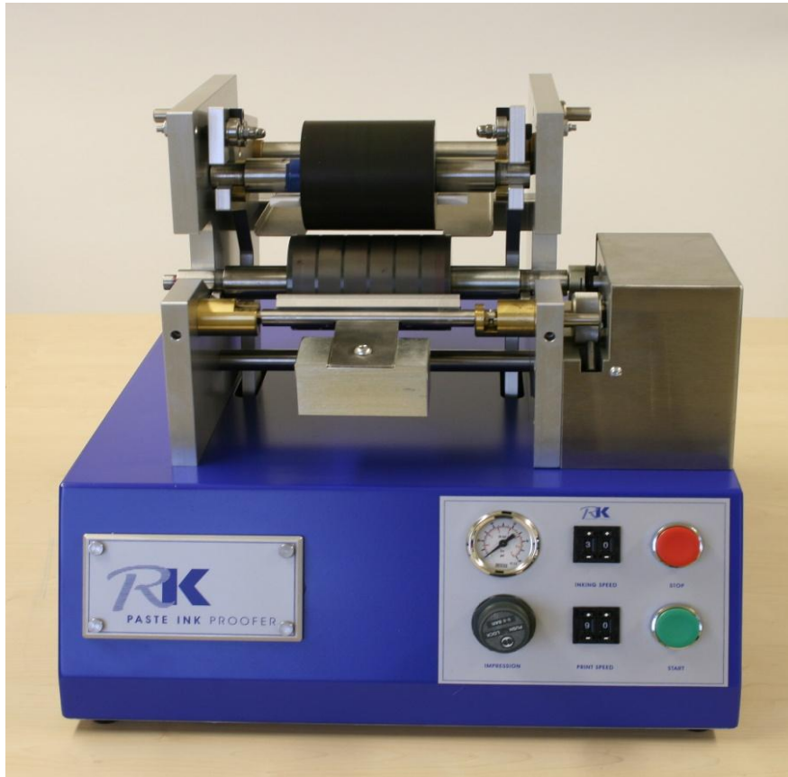
Above: Paste Ink Proofer (PIP)